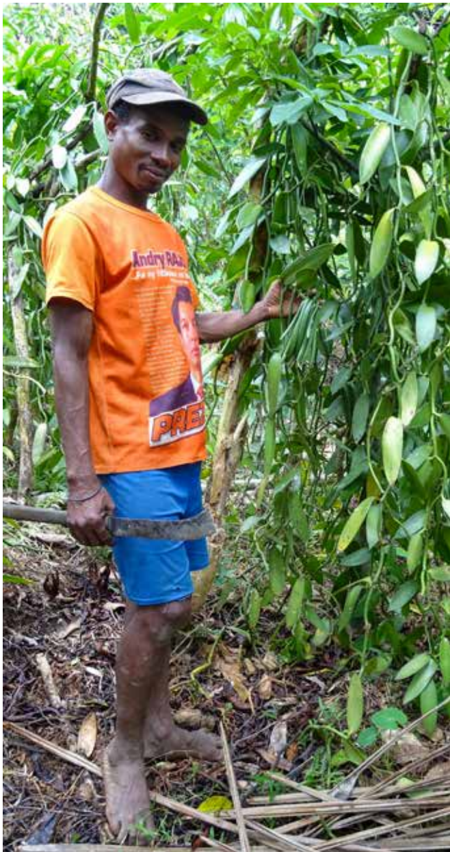
Vanilla grower.

Vanilla has been subject to much speculation and uncertainty, and has experienced considerable price fluctuations for more than twenty years. The price of a kilogram (kg) of prepared vanilla ranged from USD 6 to USD 600 between 1999 and 2016, falling back to between USD 250 and USD 400 more recently (Veldhuyzen 2019). Some of these fluctuations are linked to the vagaries of weather, growing conditions and farmers' know-how. Added to this are local security conditions, with theft of green vanilla a real problem, as well as the speculative strategies of the main players in the industry. The setting of a minimum purchase price by the government drove buyers away when this turned out to be higher than the