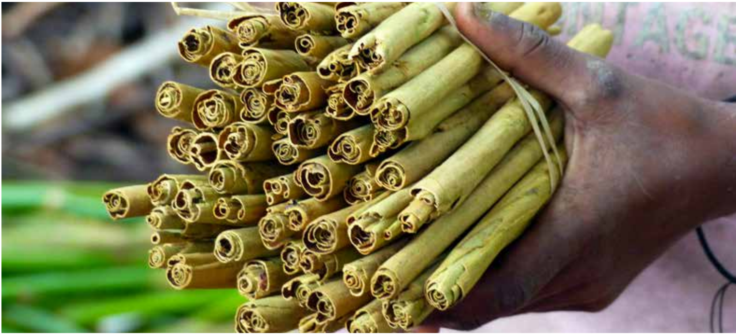
Cinnamon sticks.

major constraint has arisen in the supply of firewood to run the 5,000 to 8,000 stills of the east coast. Thought needs to be given to developing this production by, for example, promoting the inclusion of fast-growing trees in or near agroforests.