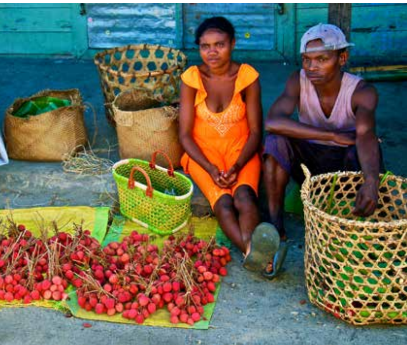
Sale of lychees at a local market.

In addition to production fluctuations, it is possible, and even likely, that there will be more numerous and more violent shocks linked to climate change, which is already having a significant impact on Madagascar (drought, floods, cyclones, rising temperatures) and which could cause lasting disruption to crop yields. Similarly, the production of essential clove oil in highly inefficient stills consumes large quantities of firewood, which puts considerable pressure on wood resources. As a result, a