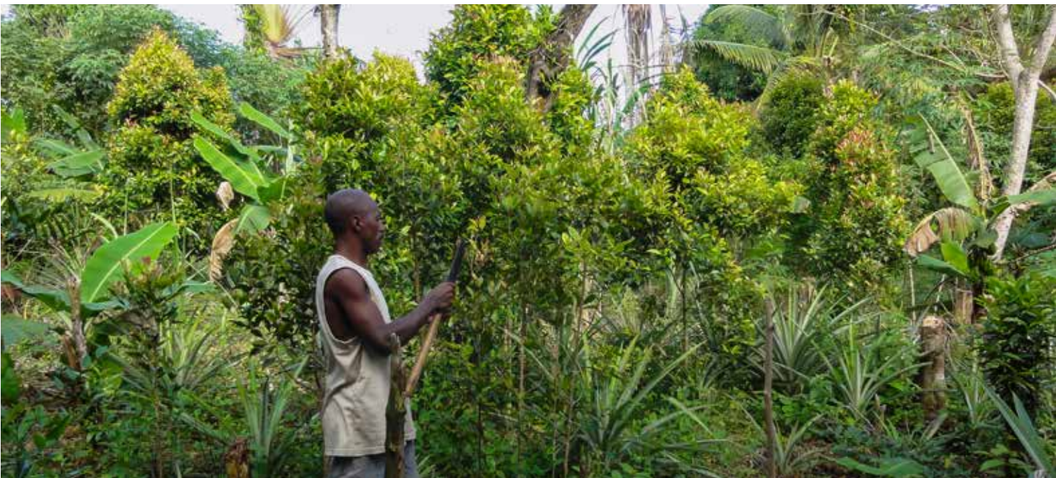
Agroforest with young clove trees.

Depending on the product, preparation is more or less complex and time-consuming.