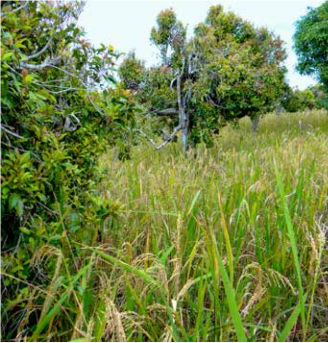
Clove trees in a rainfed rice plot.

The introduction of these crops profoundly altered ancestral family farming, which was based on the practice of tavy (slash-and-burn cultivation) on the hillsides for the production of rainfed rice and other subsistence food crops. Now, irrigated rice is cultivated in